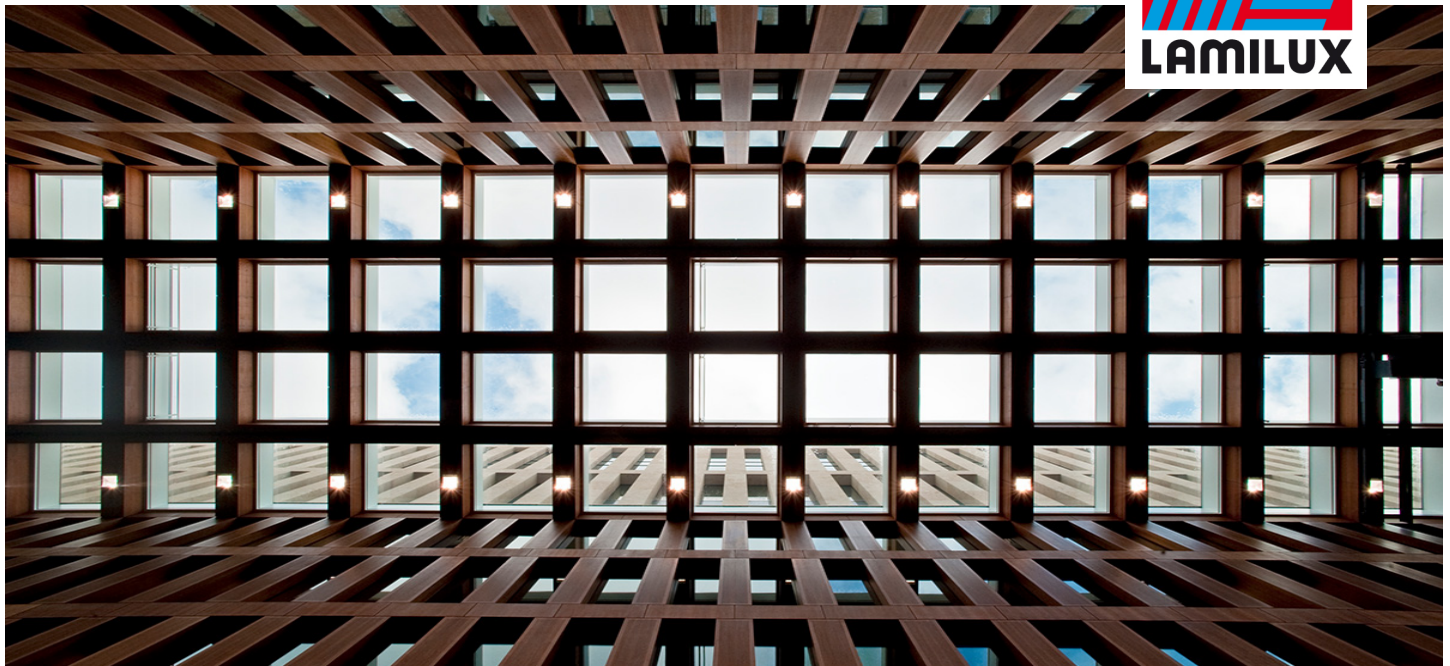
Library at Humboldt University, Berlin