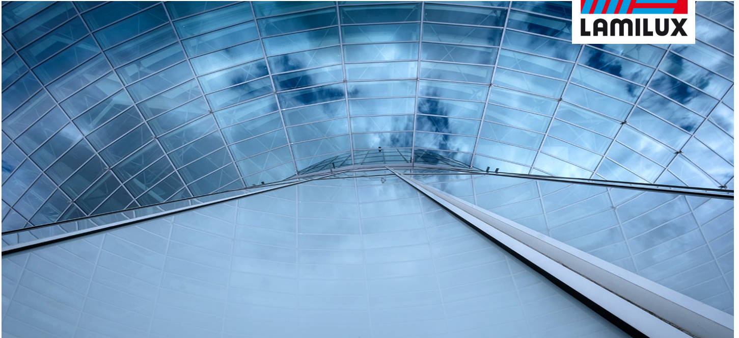
BMW FIZ, Munich (Germany)