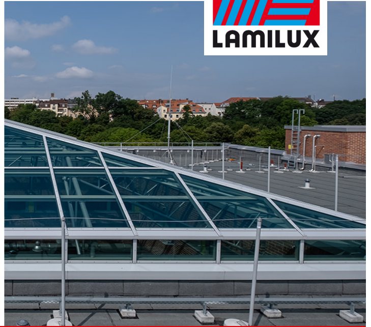
Dante Secondary School, Munich (Germany)