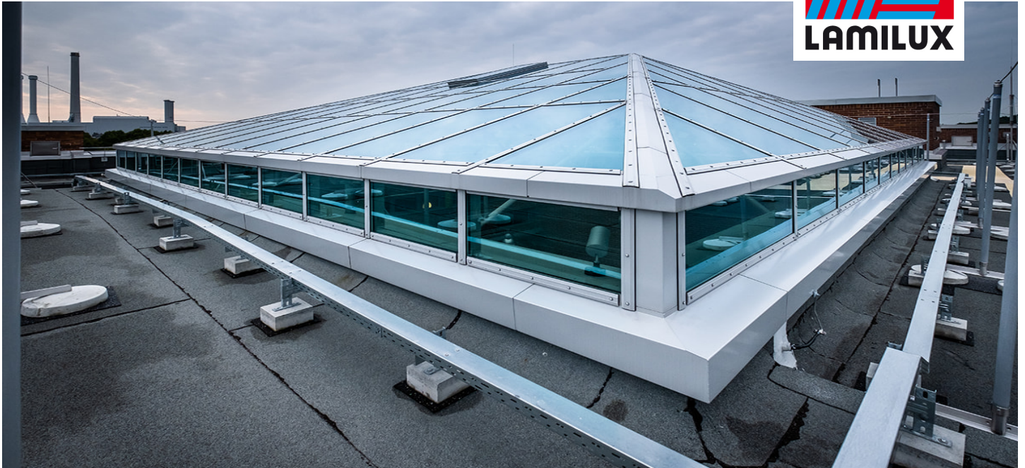
Dante Secondary School, Munich (Germany)