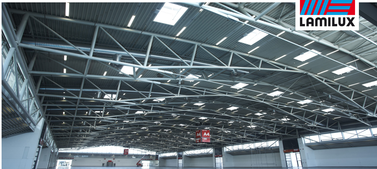
Exhibition Hall A4, Munich