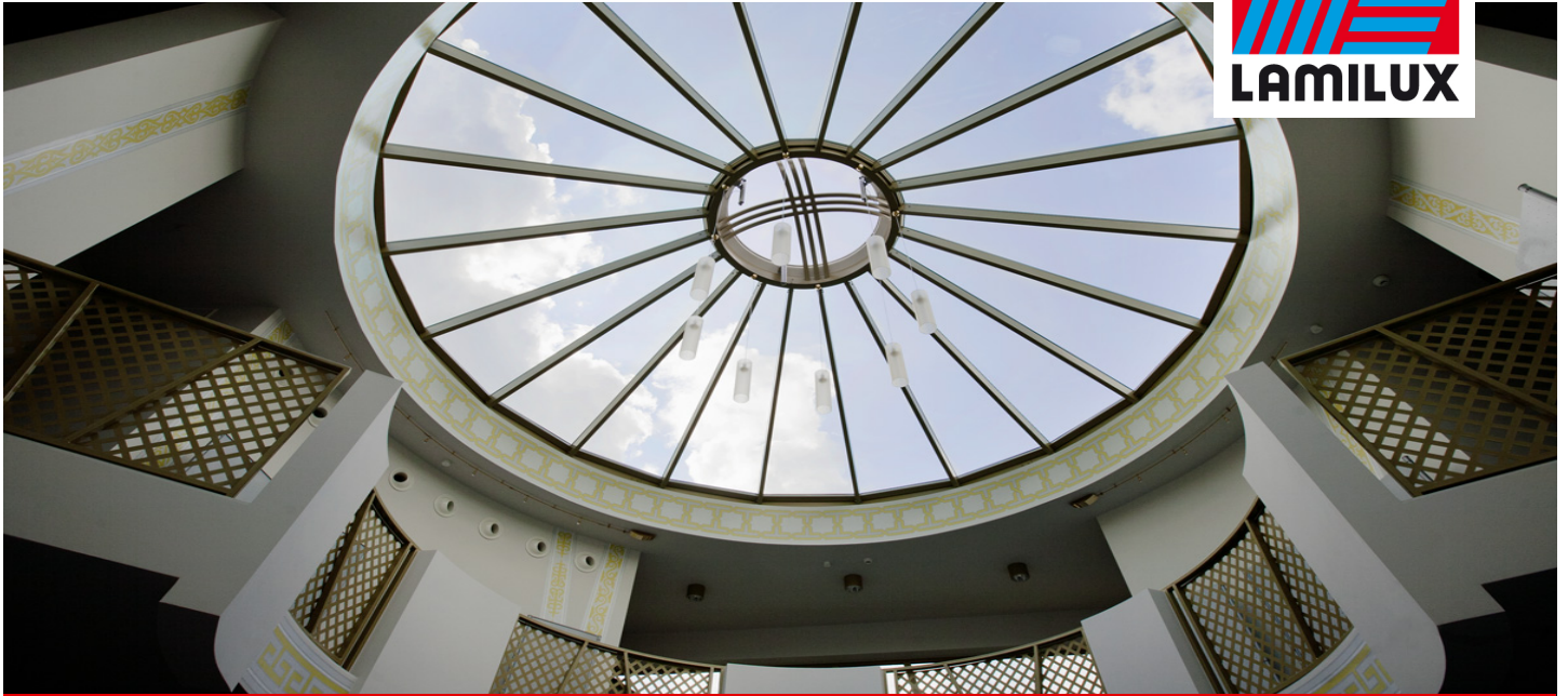
Embassy of Kazakhstan, Berlin