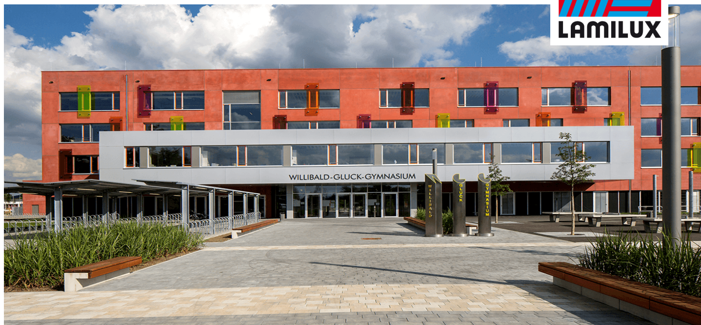
Willibald-Gluck Secondary School, Neumarkt i.d. OPf.