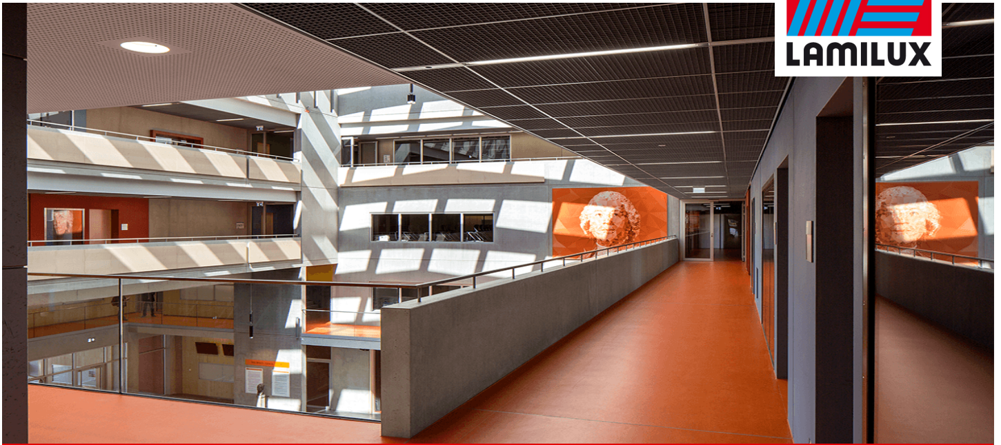
Willibald-Gluck Secondary School, Neumarkt i.d. OPf.