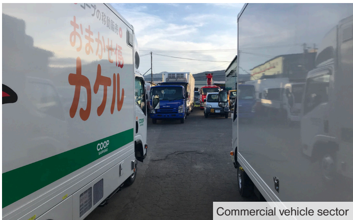
Commercial vehicle sector