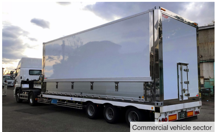
Commercial vehicle sector

The information in this brochure is based on our current knowledge and experience. It is not a guarantee of technical characteristic features in the scope of specifications. Due to the wide range of usage parameters, users themselves are responsible for testing that the product is suitable for their required use. Changes and errors excepted.