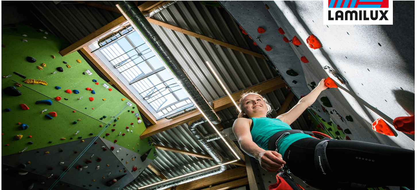
Climbing Centre OWL, Brakel