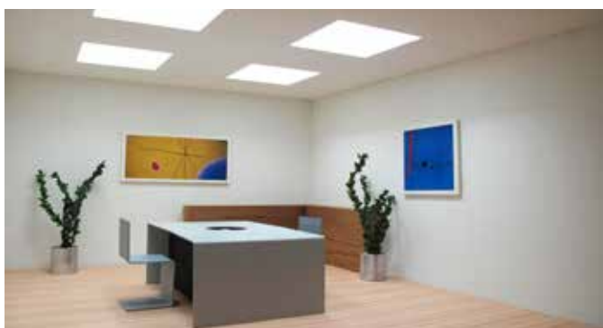
White shaft Maximum DQ at user level approx. 5%