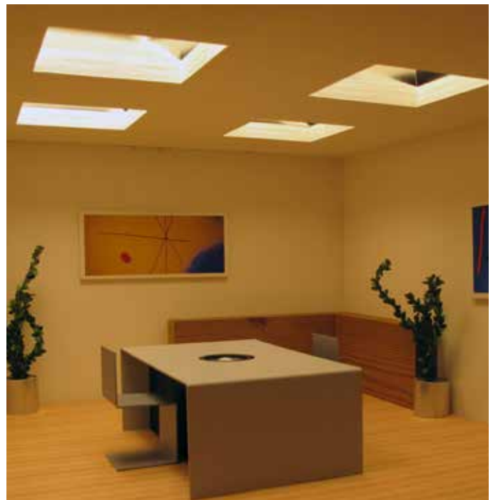
Reference image neutral white light (4,000 K) to warm white light (2,700 K)