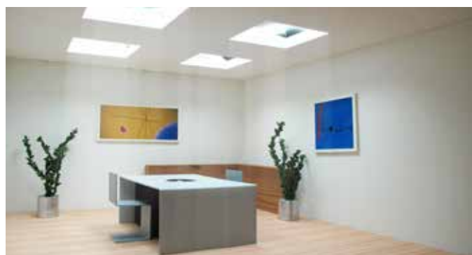
Highly reflective shaft Maximum DQ at user level approx. 8%