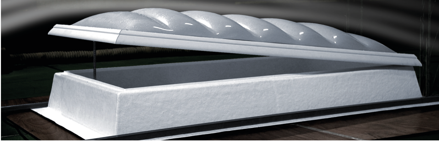
Rooflight F100 W in the extreme weather test in the wind tunnel

Still all the advantages of the proven Rooflight F100 with a wide range of variants, quality and accessories Now standard for orders received after 1 May 2022