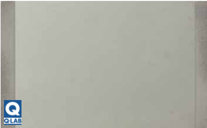
Realtime RV sidewall application in Arizona – 2.5 years

Direct weathering in Arizona (45° south) according to ASTM G7-13 – 2 years through Q-Lab laboratory USA