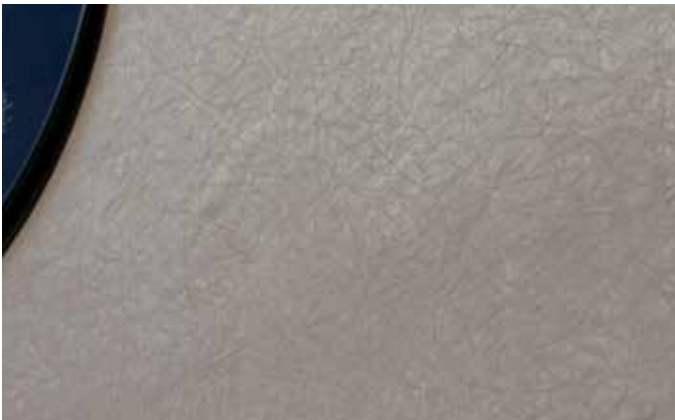
Realtime RV sidewall application with removed decals – 2.5 years