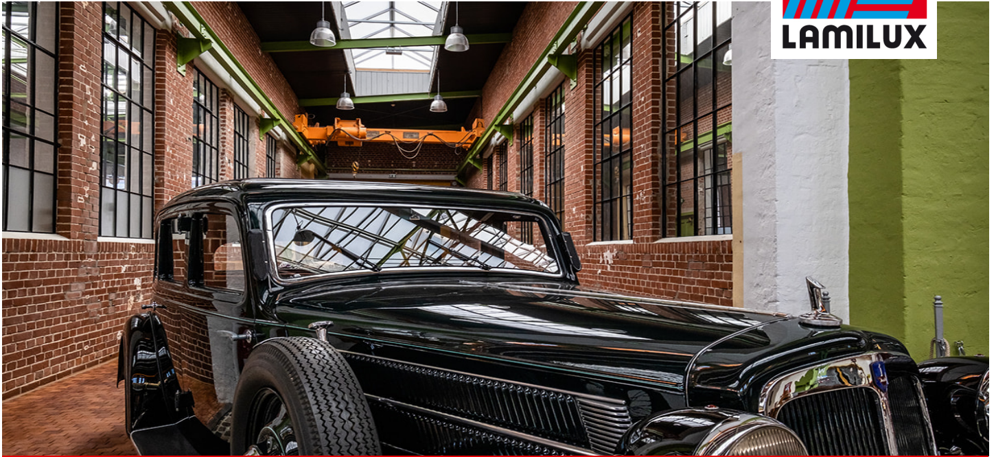
Former Production Facility, Wurzen (Germany)