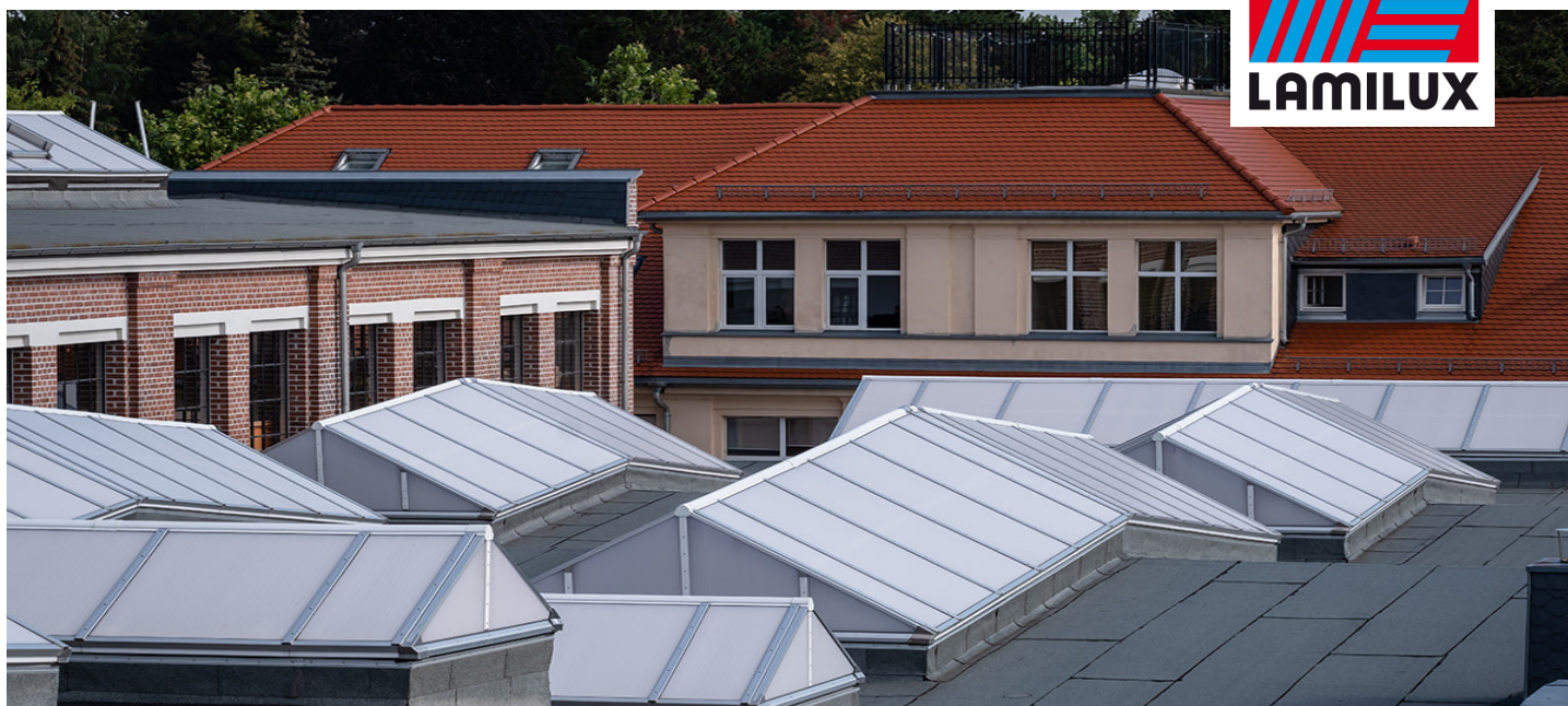
Former Production Facility, Wurzen (Germany)