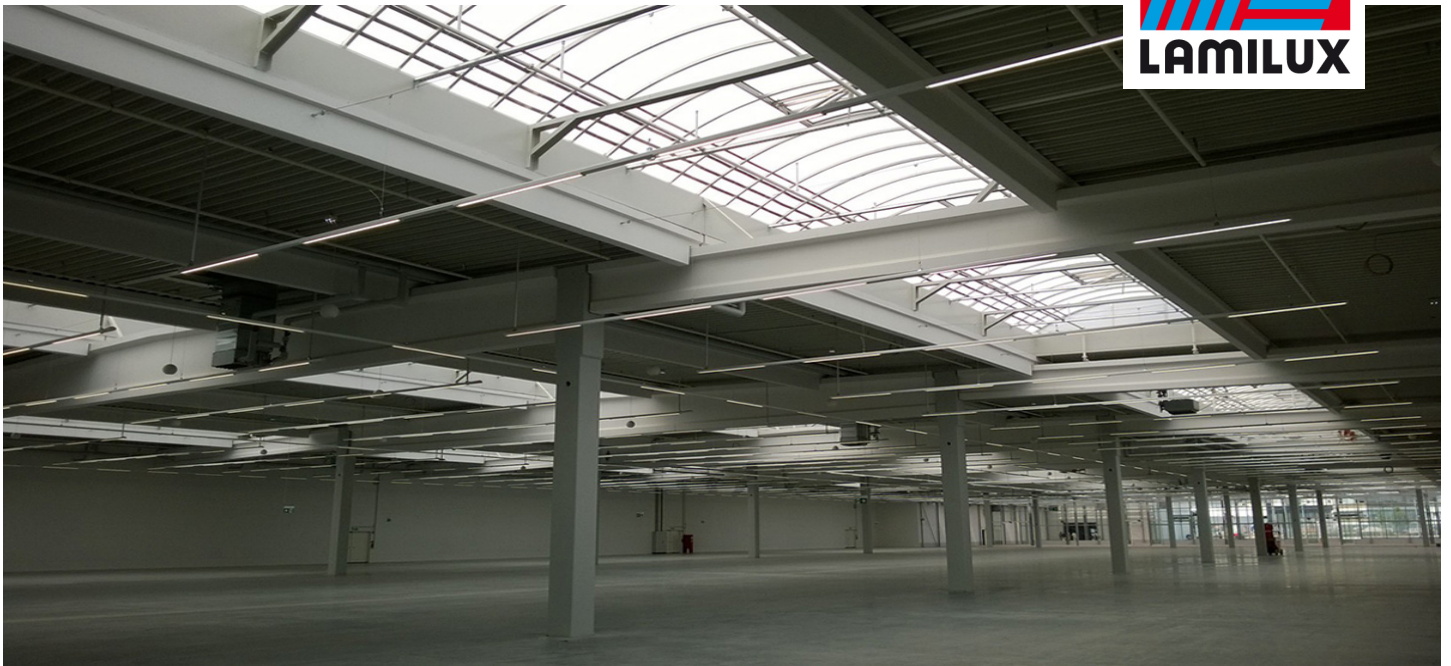
Toom construction and garden center, Langen