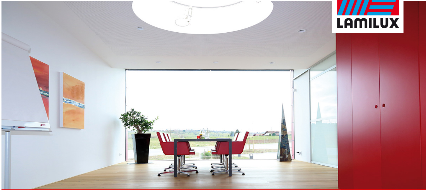
Administration and Logistics building, Ötisheim