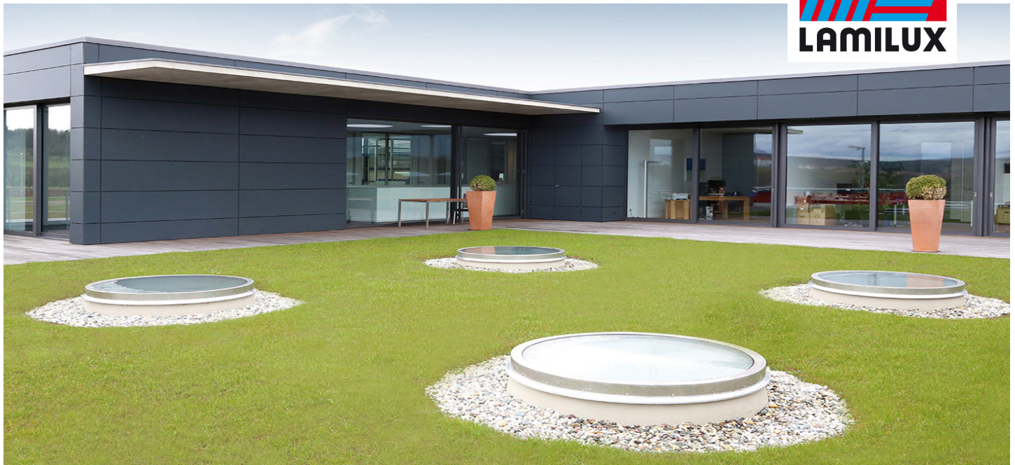
Administration and Logistics building, Ötisheim