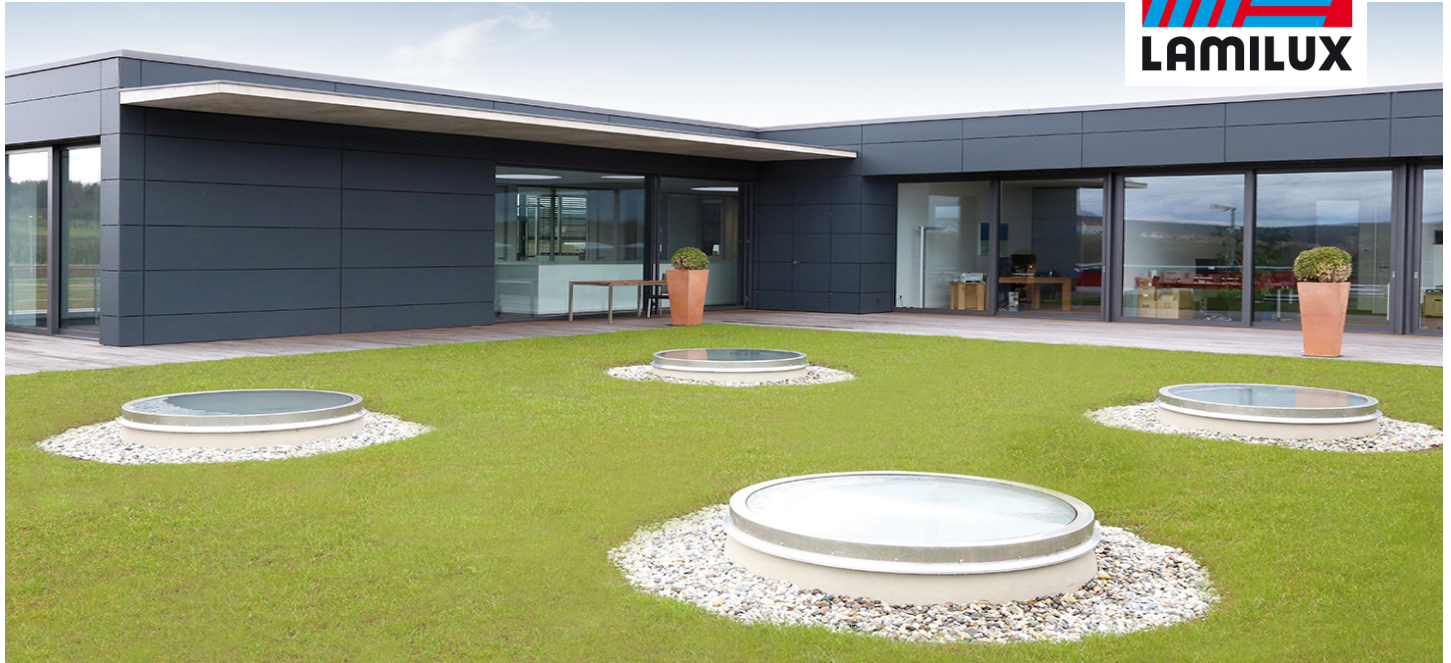
Administration and Logistics building, Ötisheim