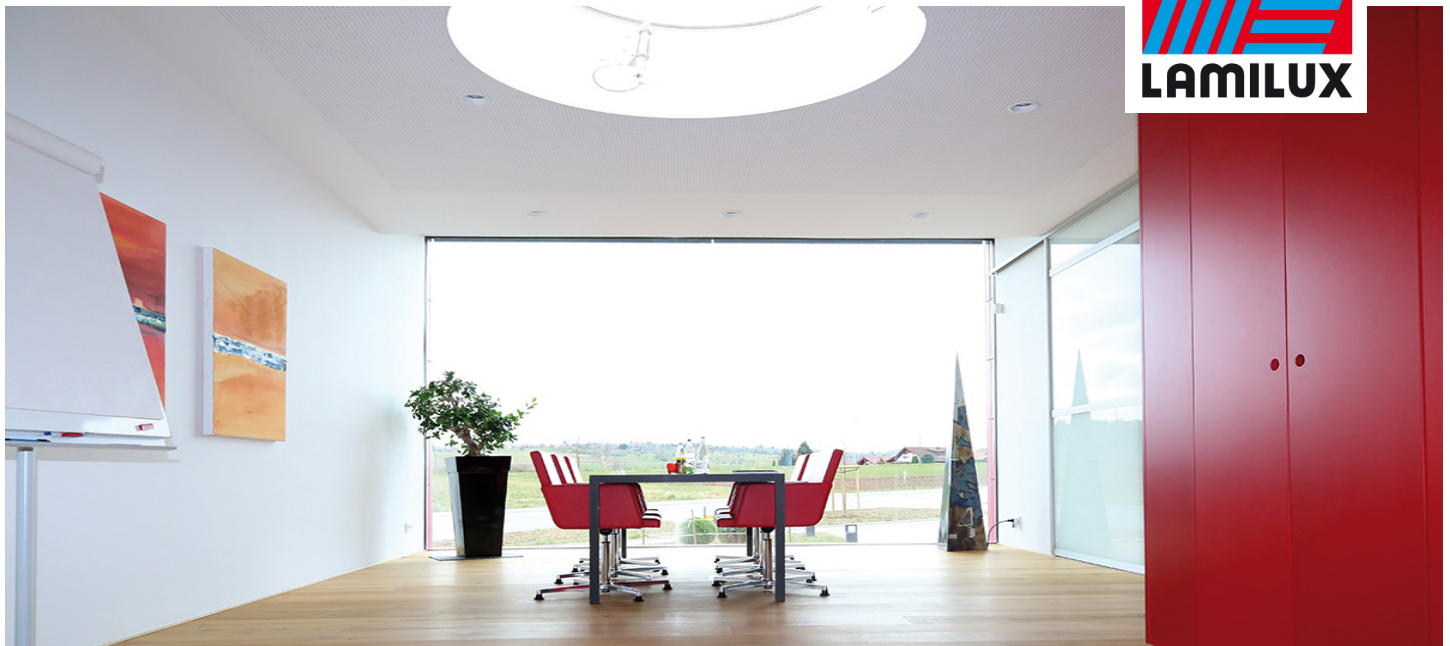
Administration and Logistics building, Ötisheim