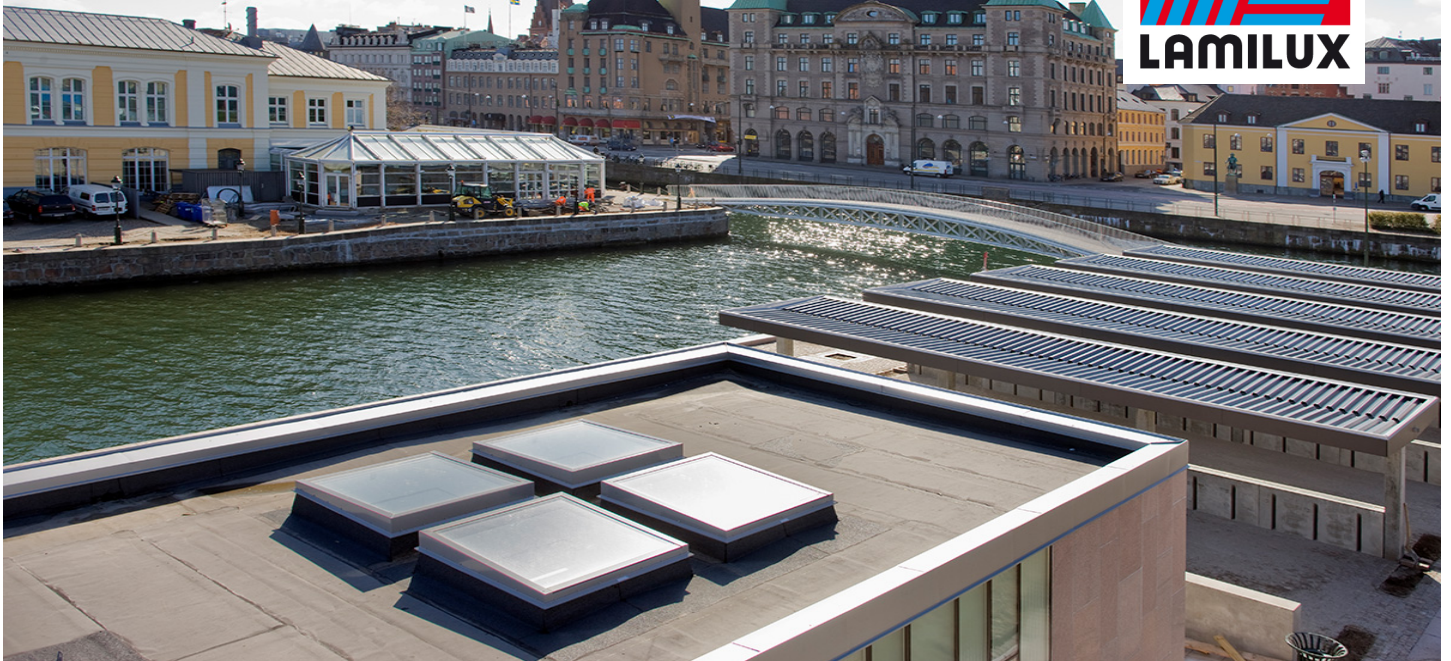
Bagers Plats, Malmö (Sweden)