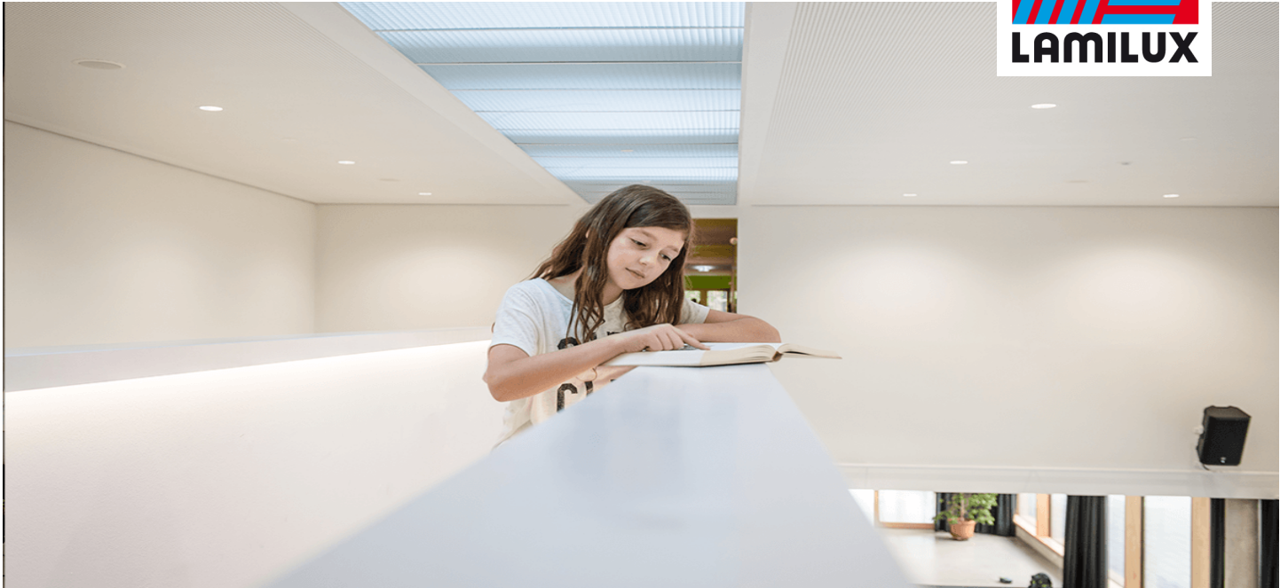
Markgraf-Georg-Friedrich Secondary School, Kulmbach