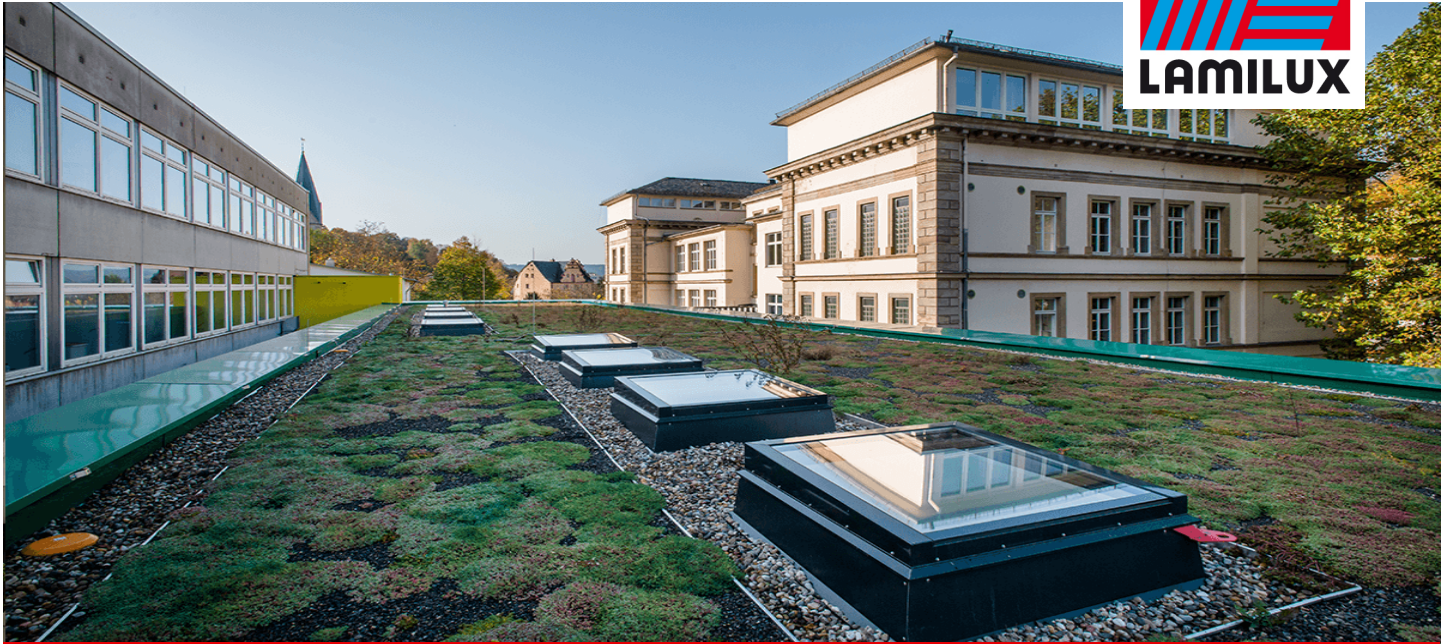
Markgraf-Georg-Friedrich Secondary School, Kulmbach