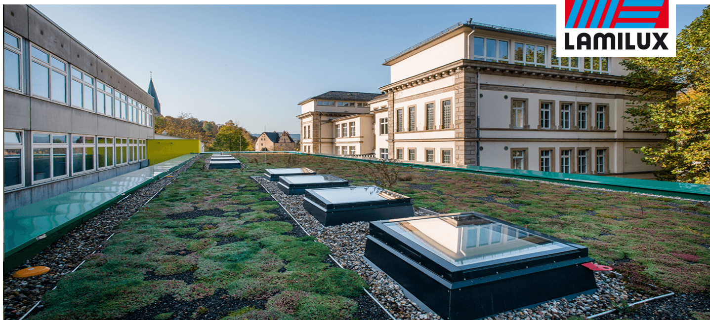
Markgraf-Georg-Friedrich Secondary School, Kulmbach