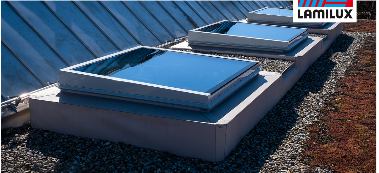
Municipal Crèche, Waltenhofen (Germany)