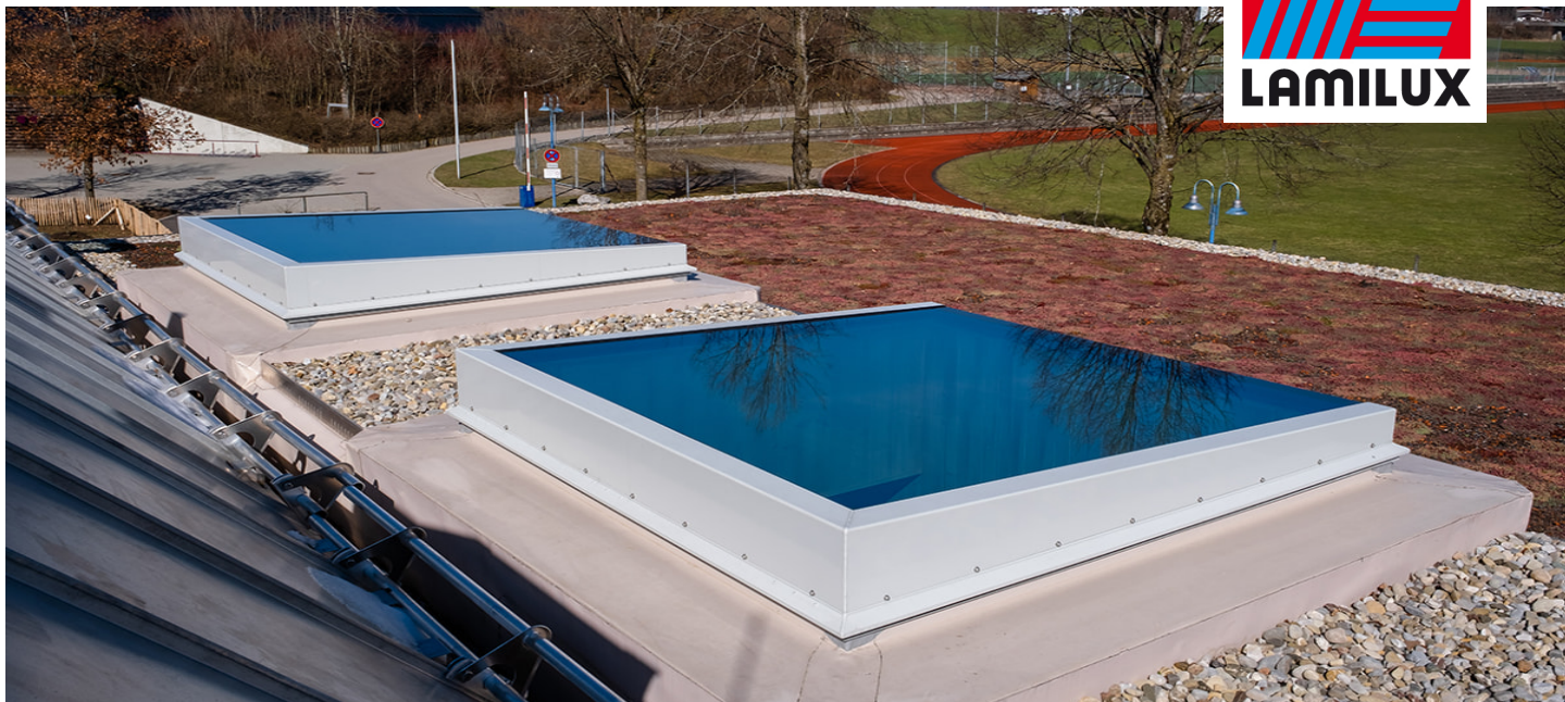
Municipal Crèche, Waltenhofen (Germany)