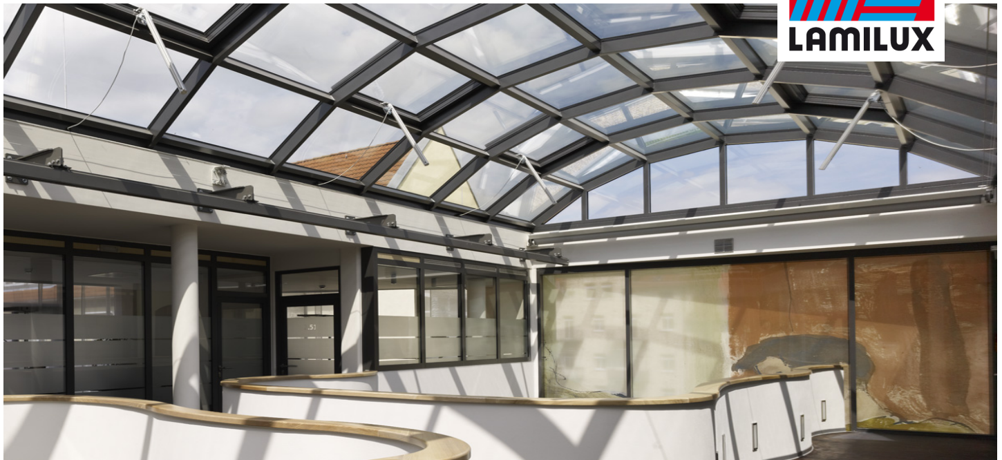
Bank Institute, Döbeln