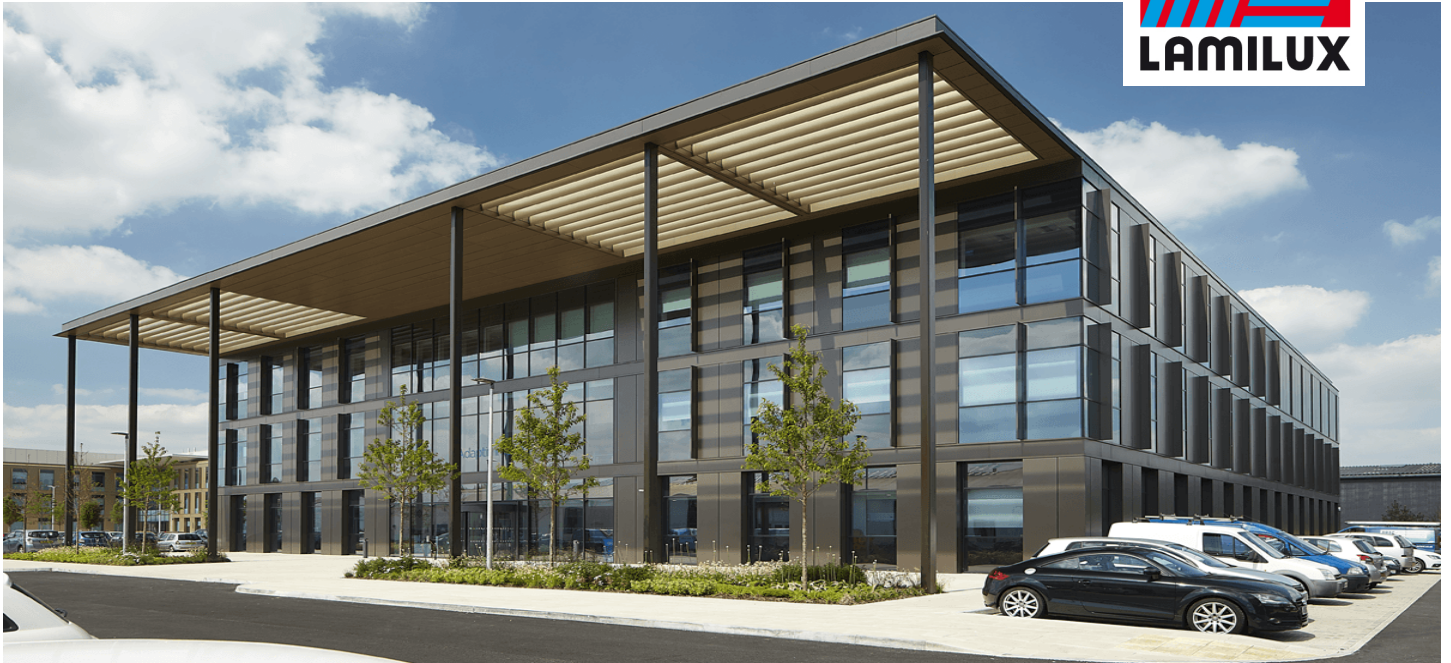
EZ1 - Milton Park, Abingdon