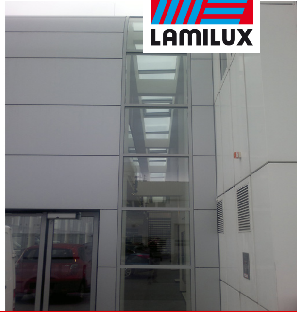
Flower auction hall, Vienna, Austria