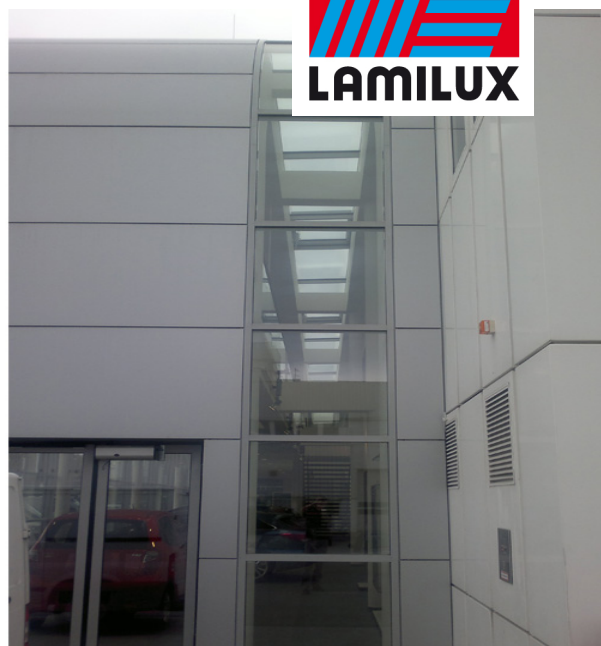
Flower auction hall, Vienna, Austria