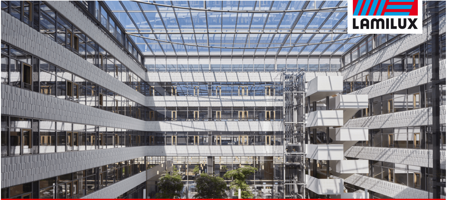
Post Mercier, Luxemburg