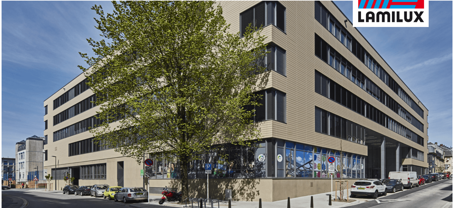
Post Mercier, Luxemburg