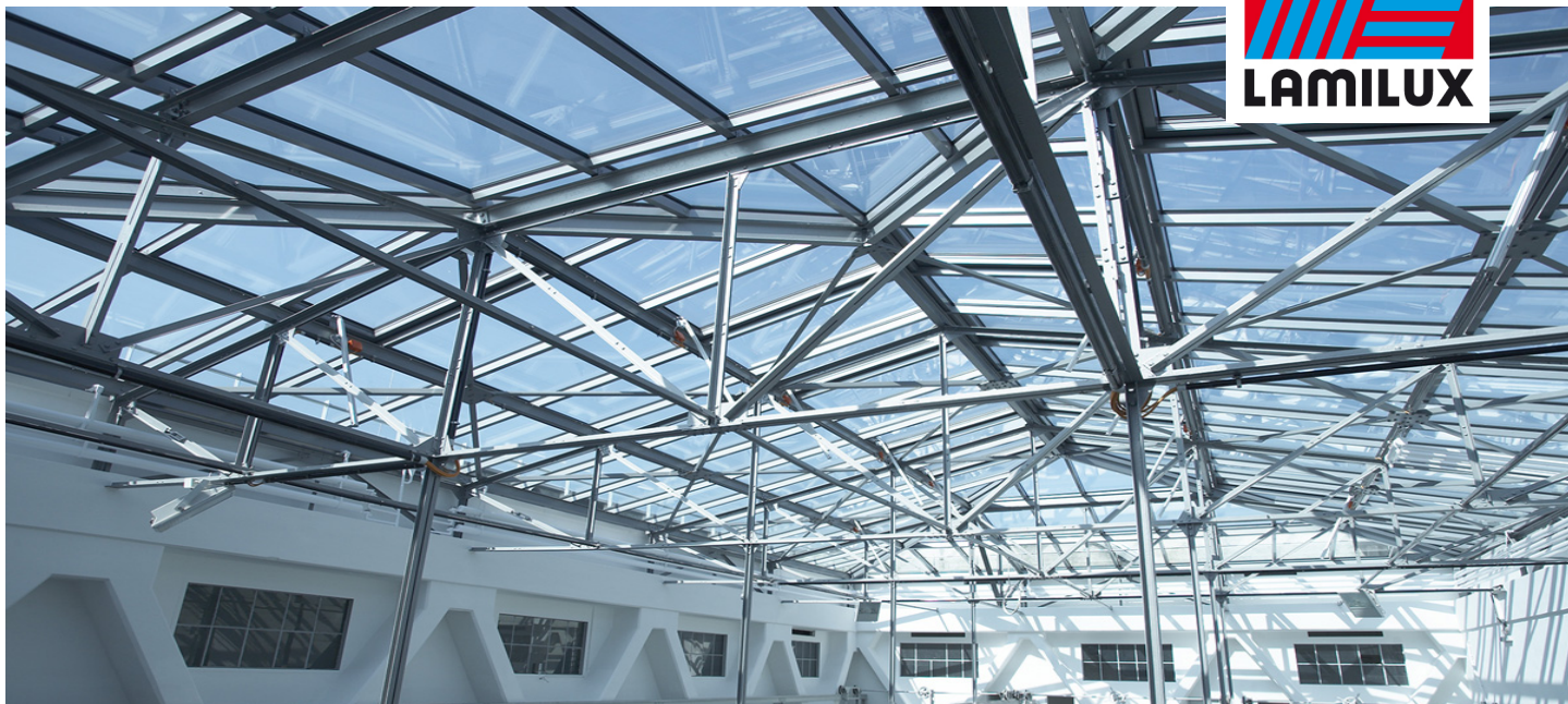
University of Music and Performing Arts, Munich